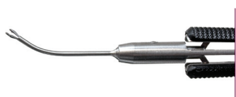
H65.12.003 ArtiFix™ Reusable Holding Forceps