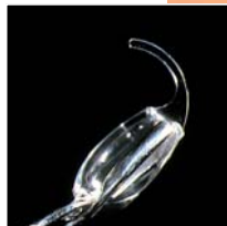
Easy folding with forceps