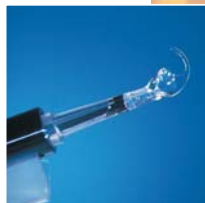
Gentle unfolding from injector